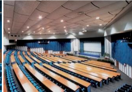
AUDITORIUM SIRENE CLASSROOM