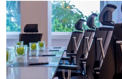
HILTON MEETING POSITANO