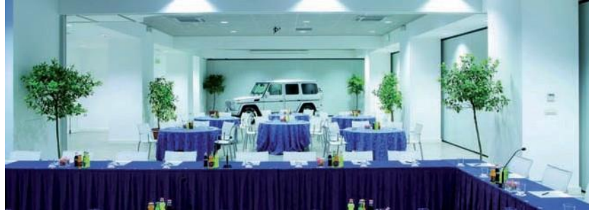
BALLROOM NETTUNO 1-3