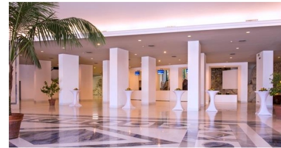
FOYER CONGRESS CENTRE