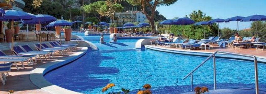
OUTDOOR SWIMMING POOL