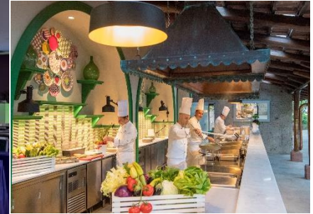
L'AGRUMETO BARBECUE AND MORE